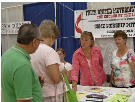
2013 Senior Expo,

On August 14th, a pharmacist was available at our booth at "The Senior and Caregiver Expo." Surprisingly few people asked questions, an opportunity missed.